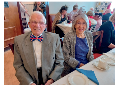
Forum lunch club regulars at the Queen's Platinum Jubilee Lunch

The Lunch Club has started again and if you would like to join us at The Newton for lunch every Wednesday at 12.30, then please come along.