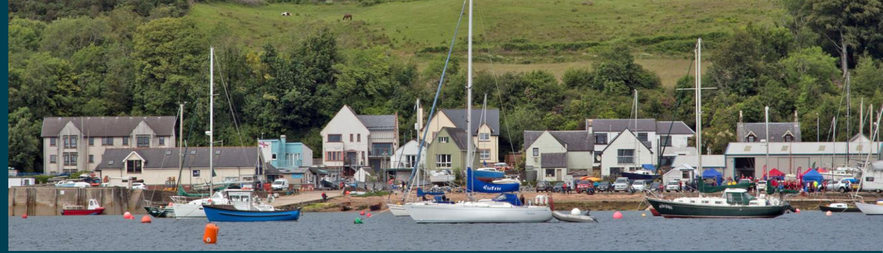
Arran Yacht Club, Lamlash

Marine infrastructure will support key components of the marine-tourism industry such as sailing and boating, paddle sports, marine leisure, and recreation.