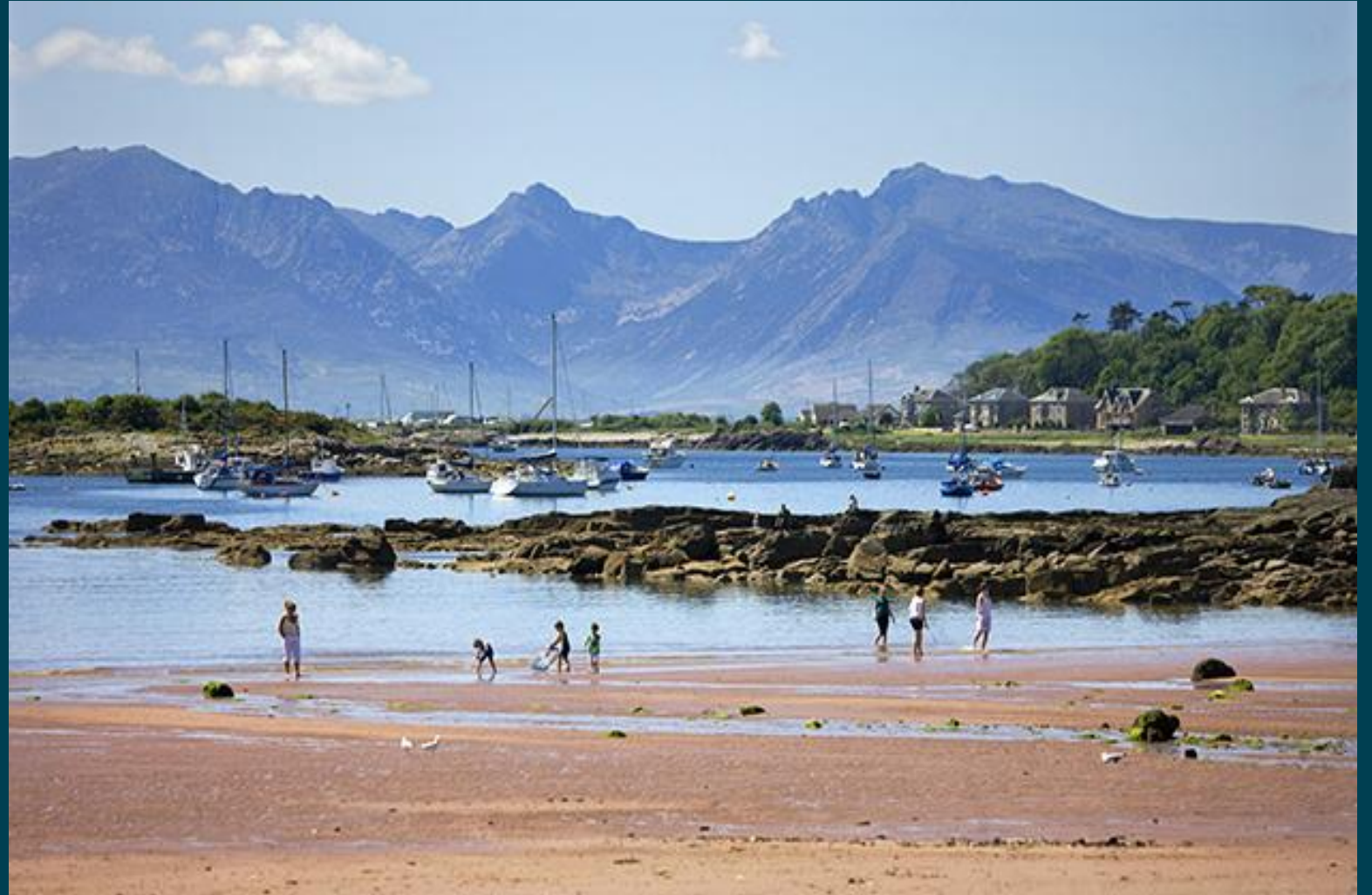
Isle of Cumbrae -Millport